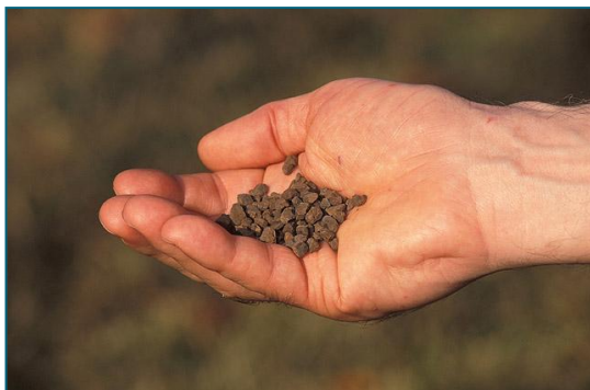
Alum based residual

Residuals are categorized as resins, membranes, filter media, sludges, and liquids. Liquid residuals include brines, concentrates, backwash water, rinse water, and acid neutralization solutions. Spent resins, filters, and membranes generally contain concentrated levels of radioactivity that may need to be sent to a facility approved for disposal of radioactive materials. A specific radioactive materials license could be required if the radioactivity exceeds State and/or Federal regulatory limits.