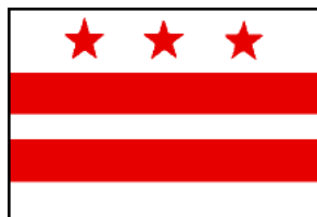
District of Columbia

http://www.deq.gov.mp/article.aspx?secID=7&artID=45