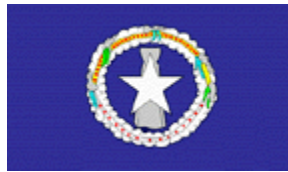
Commonwealth of Northern Marianas Islands

Here is the link the CNMI storage tank page (and regulations).