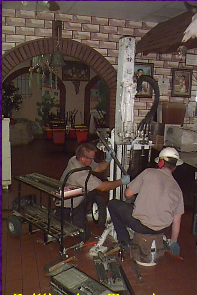
Drilling in a Taqueria