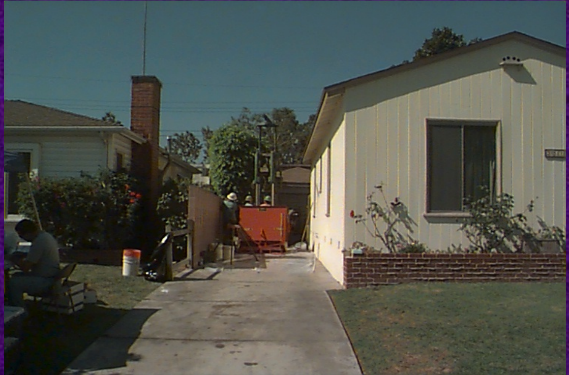
Drilling between Houses